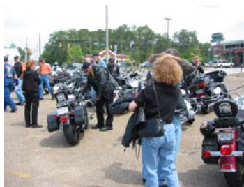
Look at all that chrome

Following April's Chapter Meeting the group took a ride led by Jim Carothers to the Crescent Grill in Hattiesburg, MS. The weather cooperated with sunny skies, cool temperatures and low humidity. Approximately 35 riders and on bikes participated in the ride.