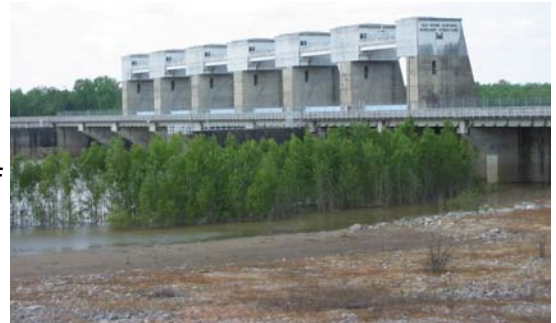
Flood control gates at Old River

I set out on a cool Saturday morning heading north on I-55 to Amite where it intersects LA 10 and in about 2 hours I pulled into ST. Francisville, LA. This is an old town full of quaint shops and restored homes but they would have to wait for another day. I continued on LA 10 until it ended at the ST. Francisville—New Roads Ferry landing. Paying my one dollar fee I eased the bike on to the steel decking and took in the panoramic view of the Mississippi. The trip across the river was short and I headed into New Roads and then north on 10 past False River. This is an oxbow lake created when the river followed the narrow stream over a neck of land (Pointe Coupee). I continued. across the Morganza Spillway to were LA 10 and 15 intersect. LA 15 follows the Mississippi river north, taking every one of its turns and twists as it crosses the area known as Old River. Here there is a series of river structures that were designed to control the path of the Mississippi River.