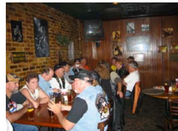
It's not all about the ride

Crescent City Grill around noon. They were expecting us at the restaurant and we got seated quickly by the staff. I for one had never been to this establishment and was immediately impressed with not only the friendly service, but with the wide selection of tasty items on the menu. I don't believe anyone went away hungry. After lunch the group broke up with some of deciding to visit a local motorcycle dealership while others made their way back home.