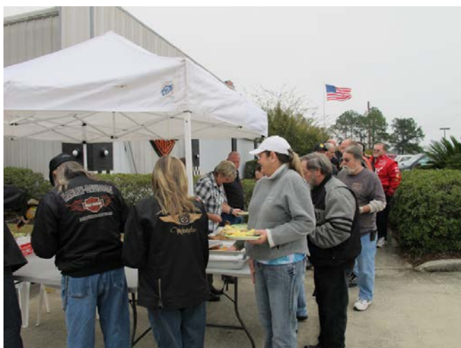
What do you do with old Harley t-shirts????