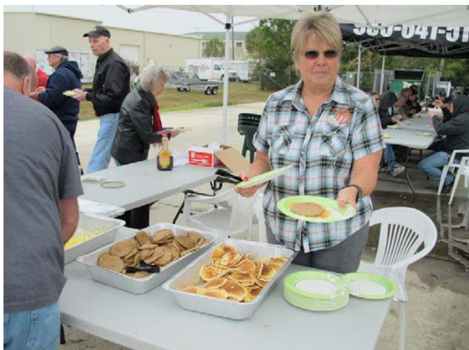
Did you miss the free breakfast after the December meeting????