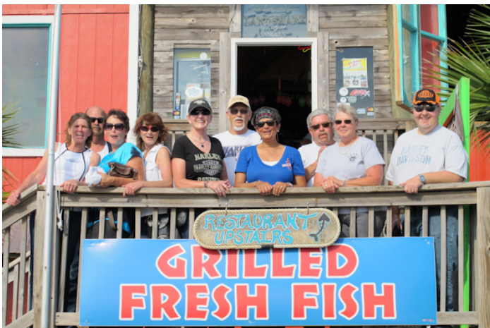
LOH Ride to Shaggy's in Pass Christian 25MAY2013