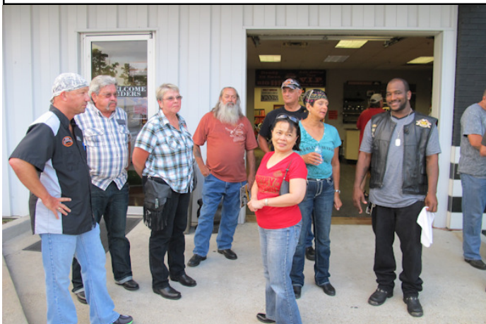
Hanging out at Bruno's Summer Thunder after the chapter ride to Darwell's !