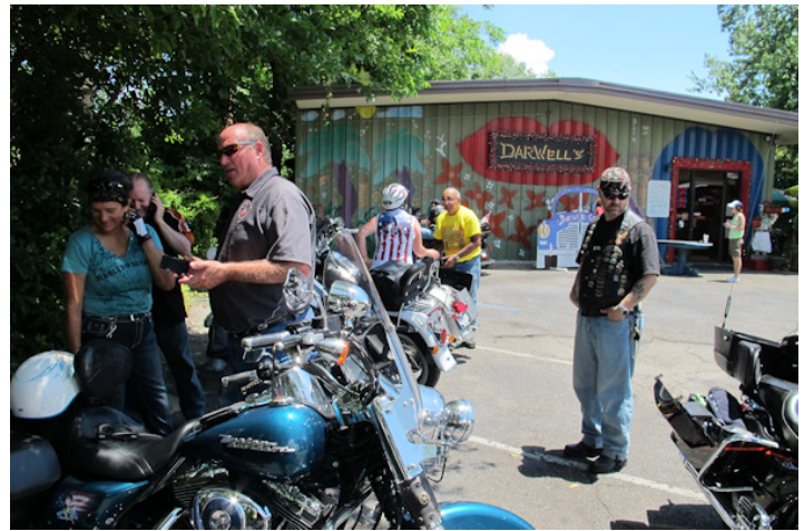
Chapter ride to Darwell's in Long Beach, Ms. Darwell's has been featured in Diners, Drive-Ins and Dives on the Food Network.