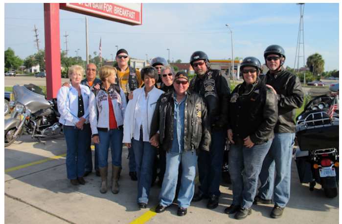
Texas State HOG Rally May 2013