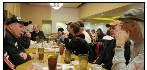
CHOWING DOWN AT THE HOLLYWOOD CASINO