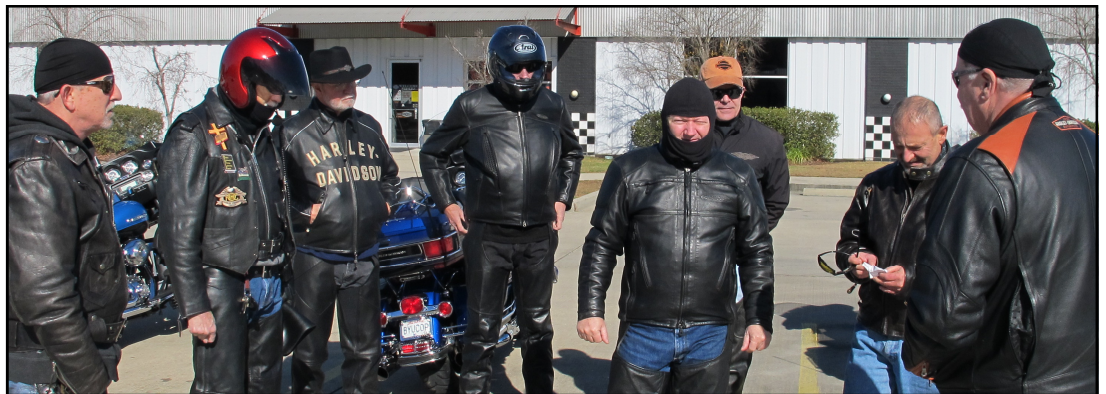
STAGING AT THE DEALERSHIP

The following are some pictures taken by our newly elected Photographer, Karl Fox.