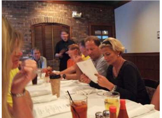
DINING AT CRESCENT CITY GRILL

The following morning we were greeted by moderate temperatures and cloudless skies. Half of the group left early; the other half, including me, left a little later after taking advantage of the free breakfast. The first departing group decided to take the fast route down the