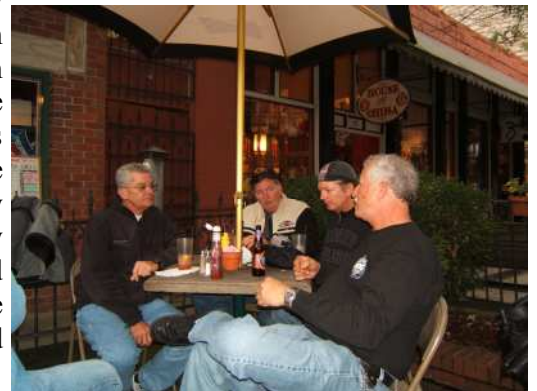
BLOODY MARYS AT EUREKA GRILL