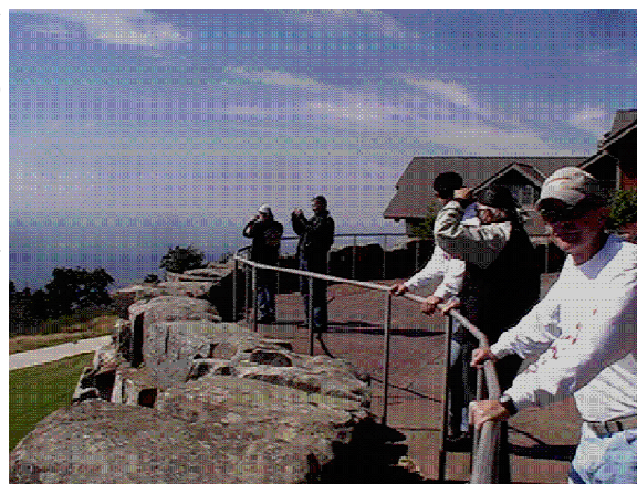
SOUTH SIDE, MT. MAGAZINE INN

admiring Flip's fleet, we departed Little Italy, via route 300. Our next stop was the highest point in Arkansas. We traveled through Houston, Perryville, Perry, and Danville, Arkansas, via routes 300, 113, 9, and 10. At Havana, AR, we turned north onto route 309 and ascended 2700 feet to the crest of Mount Magazine. The State of Arkansas built a new hotel at the top of this mountain. It rivals the best accommodations I have seen anywhere. All of the rooms have a view of the valley to the south, and the complex has luxury