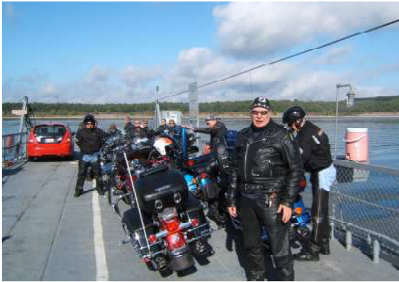
FERRY ACROSS BULL SHOALS LAKE