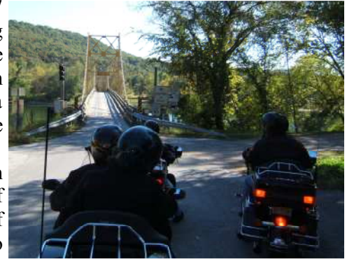
ONE-LANE BRIDGE AT EUREKA

The next day, Carl, Dan, and I escorted Dwight to the "Pig Trail Harley-Davidson" dealership in Rogers, Arkansas - 37 miles