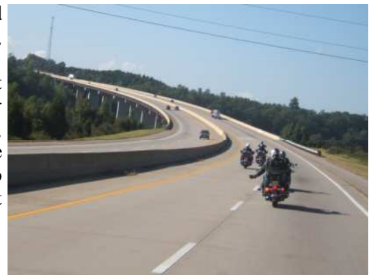
I-540 SOUTH TO FT. SMITH

From Rogers we took picturesque I-540 to Fort Smith, I-40 East to Little Rock, I-430 South to I-610 east, to I-530 South and continued southbound retracing our steps to Lake Village. There, we connected with Route 82 East, crossing the