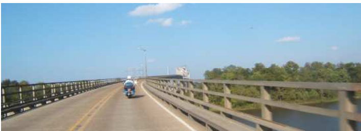
OLD RT. 82 ACROSS THE MISSISSIPPI