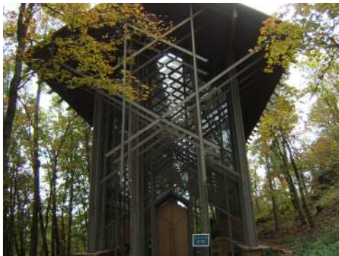
THORN CROWN CHAPEL