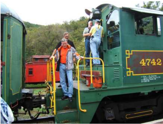
NARROW-GAGE TRAIN TRIP