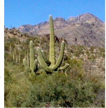
Giant Saguaro Cactus

Leaving the saguaro zone, you enter an alpine grassland ecosystem, and then pass into an alpine forest environment dominated by pine and spruce trees. Mt.