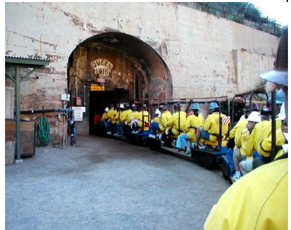
Queen Mine Tour, Bisbee, AZ

Historically, Tombstone is very interesting and is the location of the famous OK Corral, where Wyatt Earp and his deputies shot it out with the Clanton gang. Continuing on to the south on Hwy. 80, we came to Bisbee, Arizona. Bisbee is an old mining town, and has an interesting downtown square with numerous arts and crafts booths, and a variety of restaurants serving local cuisine. On the main highway in