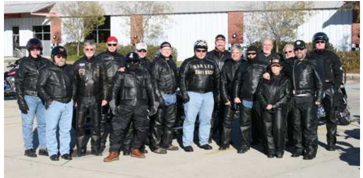
16 OF THE 20 COLD BUTT RIDERS

While the doors at Hooters were open, the restaurant was not ready to start serving yet (full service started at 11:00 am). Nevertheless, some of us rushed in to shelter ourselves. We were greeted by a photographer engaged in taking photos of a Hooters girl clad in a skimpy bikini! The photographer was doing a layout for an upcoming Hooters calendar. As he continued his duties, we seated ourselves and shed our cold weather gear at adjacent tables overlooking the front lot. At this point, the photographer approached us