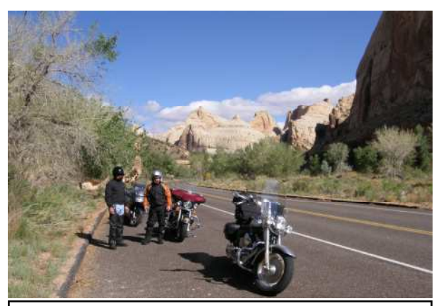
DWIGHT AND I AT CAPTIOL REEF NATIONAL PARK

On the morning of May 24, we departed Salina at about 7:00 am. The skies were clear, but the temperatures were in the low 40s. Our planned route was to take us over 500 miles through south eastern Utah, Northwestern Arizona, and ending in Farmington, New Mexico.