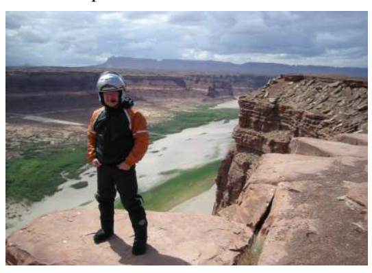
3,000 FEET ABOVE EASTERN LAKE POWELL

An hour later we entered the Glenn Canyon Recreational Area on its north side. Route 24 passes over the Colorado River Valley at the eastern extremity of Lake Powell.