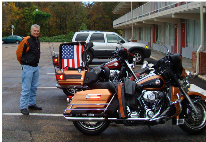
ARRIVING AT THE BATTLEFIELD INN