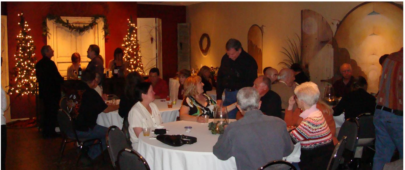
2008 CHRISTMAS PARTY AT THE WINE MARKET

Altogether the party was a terrific time. Thanks to all who attended and planned this event.