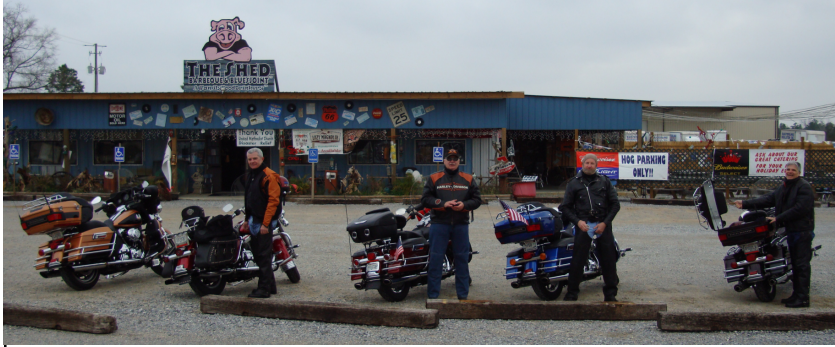
ARRIVING AT THE SHED IN GULFPORT