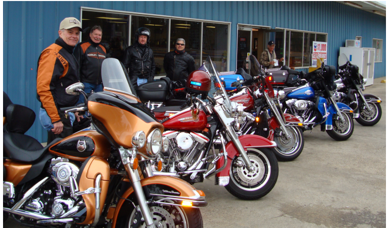
WARMING UP AT THE LOCAL GAS STOP

We rode west on Gause Blvd. to I-10 east, then North on I-59, exited at Picayune and traveled on MS Route 43 South to MS 603. Traveling north on 603, we reached its intersection with MS Route 53, where we stopped to warm up with hot coffee at a local gas station.