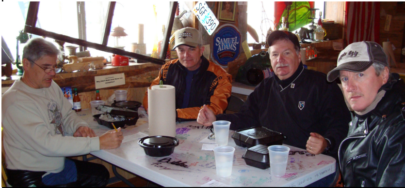
CHOWING DOWN AT THE SHED