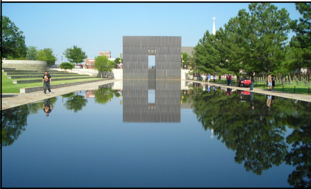
REFLECTION POOL AT OK CITY MEMORIAL