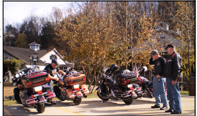
ARRIVING AT THE JACK DANIELS DISTILLARY