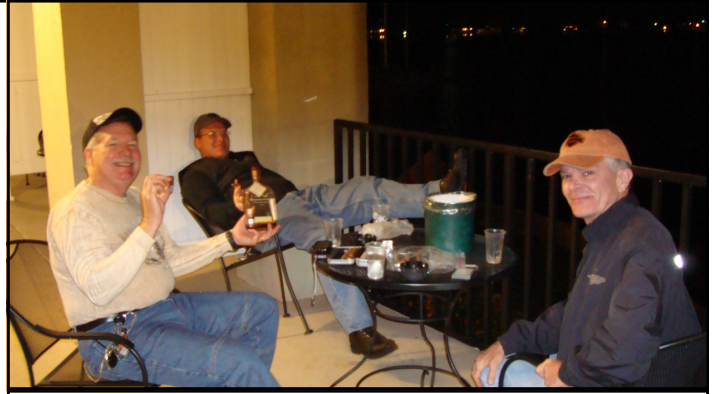
ENJOYING CIGARS, BOURBON, AND FULL STOMACHS

We logged 1230 miles on our four-day excursion, and were blessed with good weather, great roads, good food, good lodging, and great company – all of which created exceptional memories. I'd do it again in a minute!