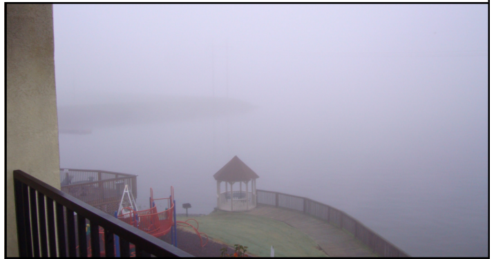
SUNDAY MORNING IN GUNTERSVILLE