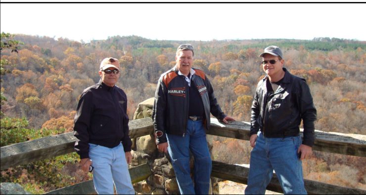
GREAT VIEWS AT BUCK'S POCKET STATE PARK

Having traveled over 200 miles that day, we decided to stay put and enjoy the culinary delights of the resort's restaurant. After a copious meal, we parked our bodies on the second floor deck of the hotel and enjoyed bourbon, cigars, great views, conversation and good company until exhausted.