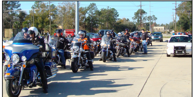
ENBARKING ON THE MARQUETTE GIFT RUN