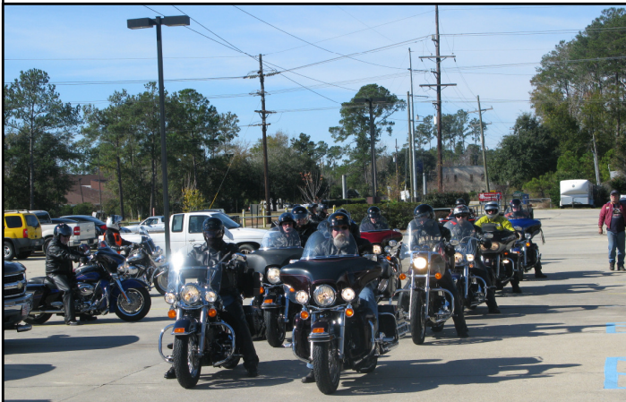
COLD BUTT RIDERS LEAVING THE DEALERSHIP