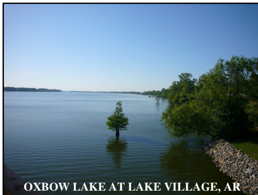
OXBOW LAKE AT LAKE VILLAGE, AR