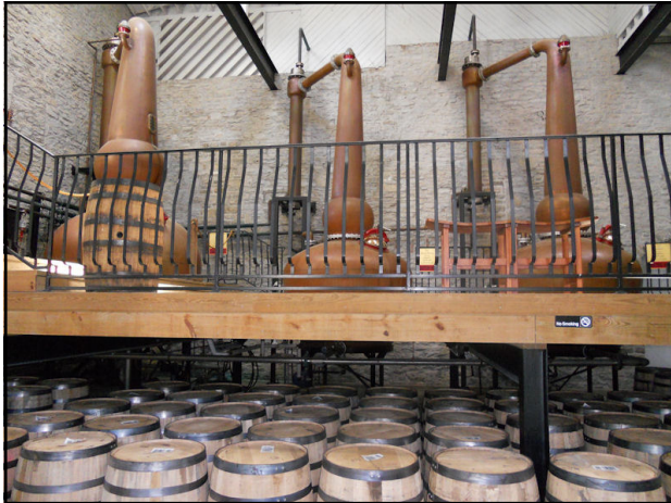
WOODFORD RESERVE DISTILLERY

have never found this place nestled in the foothills west of Lexington, KY. Actually, you could find it without a GPS, but you would have to stop every 2 miles to look at a map or have a very detailed local map on your gas tank! These places lend a new meaning to rural. There also are no signs leading you to these distilleries. Our guess is that since they are in dry counties (no alcohol) that no signs are allowed. Anyway we found the Wild Turkey distillery and went on a guided tour. The distillery was not in operation as they were building a new one up the road to double their production. It seems Wild Turkey is very popular overseas. The tour was still entertaining with lots of history dating back to the 1800's. Once we finished up the tour and hit the distillery store again, we headed off for the Woodford Reserve Distillery.