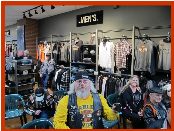
THIRD PLACE 50/50 WINNER - HARLEY WALLET